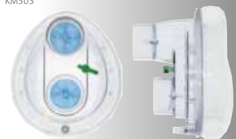
Size S KPM003M